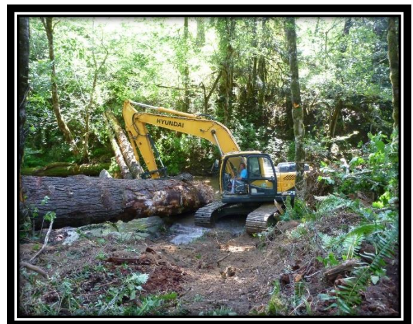
Large log being placed to improve salmonid habitat.