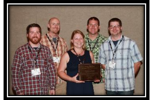
PUR and Partners awarded the American Fisheries Society 2015 Western Division Award of Excellence in Riparian Management